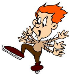
Learning to skate is GREAT!

Please note: Skaters who have not paid the annual Skate Canada membership fees through a Skate Canada Club must pay an additional $32.70 .