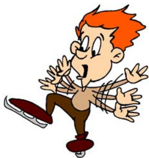
Learning to skate is GREAT!

Please note: Skaters who have not paid Skate Canada mem- bership fees through a Skate Canada Club must pay an additional $30.70 .